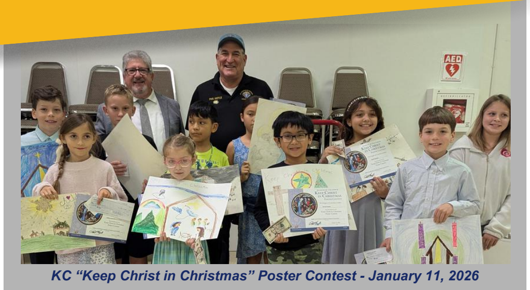
KC "Keep Christ in Christmas" Poster Contest - January 11, 2026